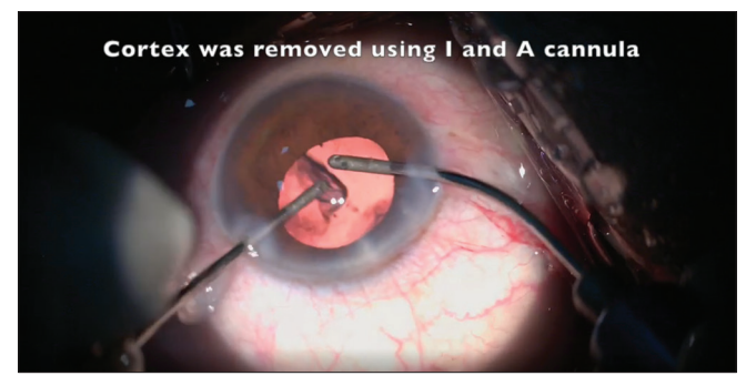
Video 2: The application of the Two-Y crushing technique in hard, deep brown cataracts without successful hydrodelineation.

Sculpting was attempted but failed with parameters set at torsional (100) and longitudinal (10) because of the hardness.