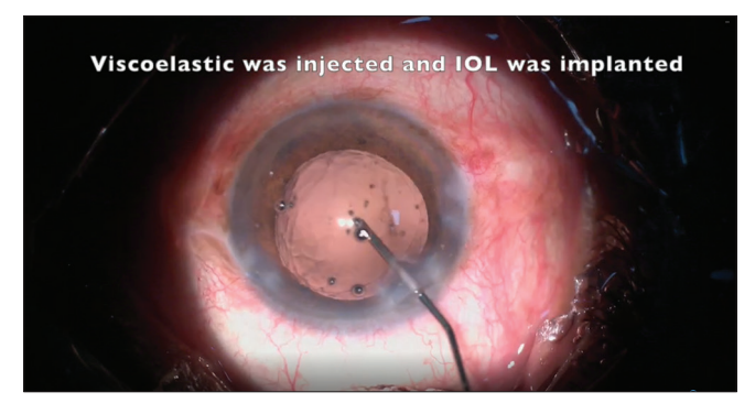
Video 1: The application of the Two-Y crushing technique in hard brown cataracts with successful hydrodelineation.

a 2.2 mm clear corneal main port incision was made at the 11 O'clock position, followed by a 6 mm continuous curvilinear capsulorhexis. Hydrodissection followed by hydrodelineation was successfully performed, indicated by the formation of a golden ring [Figure 1a]. Dispersive viscoelastic (viscodissection) was injected into the golden ring (epinucleus cleavage plane), which completely disassembled the endonucleus [Figure 1b]. A one-Y rotator was passed beneath the nucleus through the 2 O'clock side port to lift and prolapse the nucleus into the anterior chamber [Figure 1c]. Another Y rotator was inserted through the 9 O'clock side port to crush the nucleus into multiple pieces [Figure 1d], similar to bi-hand crushing as similar to the Two-Y crushing technique<sup>[10]</sup> in case of posterior polar cataract. Initially, on the first attempt, the crack did not