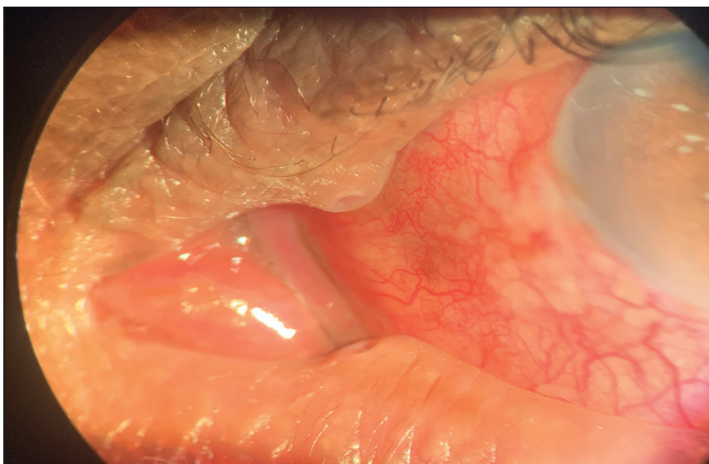
Figure 2: Punctal eversion.