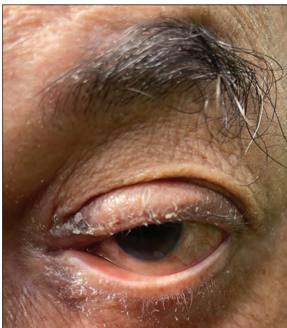
Figure 3: Periocular dermatitis with lower lid ectropion and punctal eversion.

Brimonidine was discontinued, and the patient was shifted to another equivalent anti-glaucoma medication. The adverse reactions abated in 3 weeks.