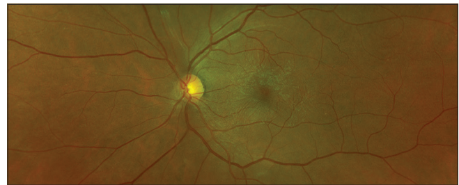
Figure 1: Optos colour picture showing cellophane reflex with a few retinal striae on the macula.

Spontaneous separation of ERM from the retina is known to occur, although rarely, such an event may result in the improvement of visual symptoms in symptomatic patients. The regular use of optical coherence tomography (OCT) enables closer study of ERMs, particularly in asymptomatic patients. It also readily shows when spontaneous resolution occurs.