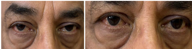
Figure 1: Showing pre operative image.

On the 1 st postoperative day, the BCVA in the operated eye improved to 20/40 with a cylinder of -1.0^\circ at a 120^\circ axis. Residual esotropia was measured at 8 prism dioptres, and intraocular pressure was recorded at 20 mmHg in the right eye. The patient's IOL was at 110^\circ and was subsequently redialled to 124^\circ on the second post-operative day, resulting