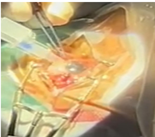
Figure 3: Showing Intraocular implantation of lens.

in BCVA improvement to unaided 20/20 for distance and N6p for near with orthophoria within 2 days.