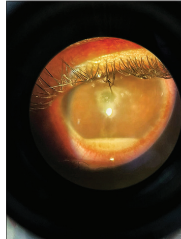
Figure 1: Slit lamp examination picture on diffuse illumination on presentation showing 1 mm hypopyon in the anterior chamber.

In the meantime, USG of both kidneys was performed for the flank pain that revealed the presence of the right-sided ureteric stone (measuring 6 mm in diameter) with obstructive uropathy and pyelonephritis for which he then underwent right-sided double J stenting. A urine culture showed presence of Gram-positive lactose fermenting bacilli, not isolated on any of the previous blood or urine cultures or vitreous biopsies, for which he was started on injection of Meropenem 500 mg twice a day for 7 days. The patient is