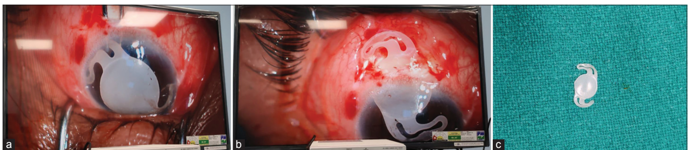
Figure 2: (a) Opacified intraocular lens (IOL) in the anterior chamber. (b) Opacified IOL was extracted through the 6–7 mm scleral tunnel. (c) Opacified IOL extracted in toto.

IOL opacification, even though rare, is a recognised complication following cataract surgery. In our case, the opacification was attributed to calcific deposits on the IOL haptic and optic surfaces. Many speculations have been made regarding the exact mechanism of IOL opacification. It is found to be multifactorial. Many ophthalmologists have been reporting similar cases of opacification with various theories as the predisposing cause of opacification. The duration between surgery and the onset of IOL opacification ranged from 1 month to 6 years. [16]