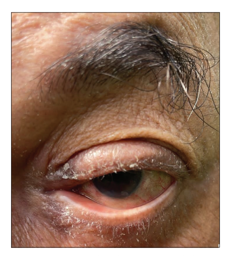
Figure 3: Periocular dermatitis with lower lid ectropion and punctal eversion.

Brimonidine was discontinued, and the patient was shifted to another equivalent anti-glaucoma medication. The adverse reactions abated in 3 weeks.