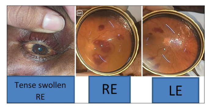
Figure 3: Case 3 - Right eye is tense swollen Fundus examination of right eye showing multiple subretinal hemorrhages, with tortuous blood vessels and blurred disc margins. Fundus examination of the left eye shows multiple subretinal hemorrhages with tortuous blood vessels. RE: Right Eye, LE: Left Eye.

count of 1.77 \times 10^3/\mu L (75.9%), suggestive of leukopenia and granulopenia. Haematocrit level was measured at 10.5%,