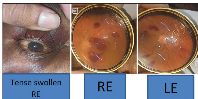
Figure 3: Case 3 - Right eye is tense swollen Fundus examination of right eye showing multiple subretinal hemorrhages, with tortuous blood vessels and blurred disc margins. Fundus examination of left eye shows multiple subretinal hemorrhages with tortuous blood vessels. RE: Right Eye, LE: Left Eye.

count of 1.77 \times 10^3/\mu\text{L} (75.9%), suggestive of leukopenia and granulopenia. Haematocrit level was measured at 10.5%,