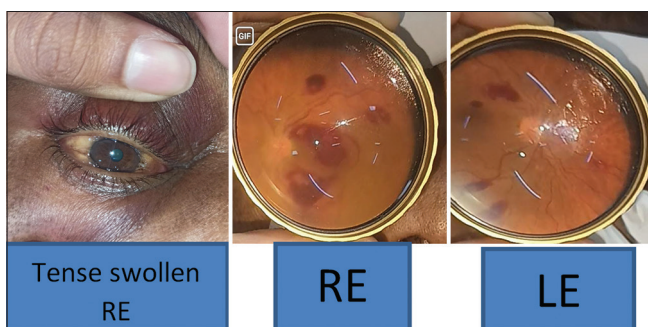
Figure 3: Case 3 - Right eye is tense swollen Fundus examination of right eye showing multiple subretinal hemorrhages, with tortuous blood vessels and blurred disc margins. Fundus examination of the left eye shows multiple subretinal hemorrhages with tortuous blood vessels. RE: Right Eye, LE: Left Eye.

count of 1.77 \times 10^3/\mu\text{L} (75.9%), suggestive of leukopenia and granulopenia. Haematocrit level was measured at 10.5%,